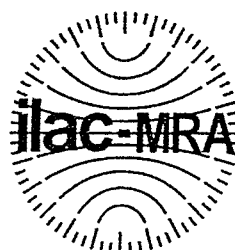
PROCESS (CMYK) COLOUR BREAKDOWN